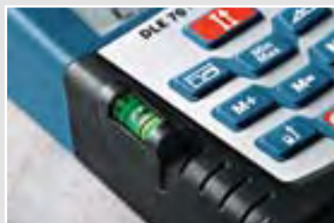
with integrated spirit level