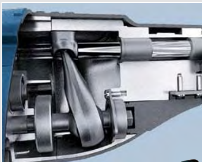
Brute™ Drive system